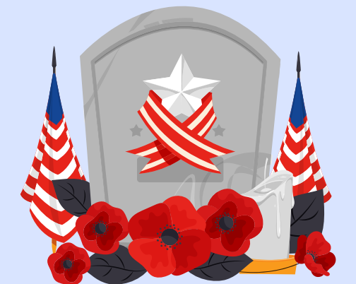
Art by Freepik

Please scan the QR code with your phone to access the educational documents and complete an optional survey on what you learned!